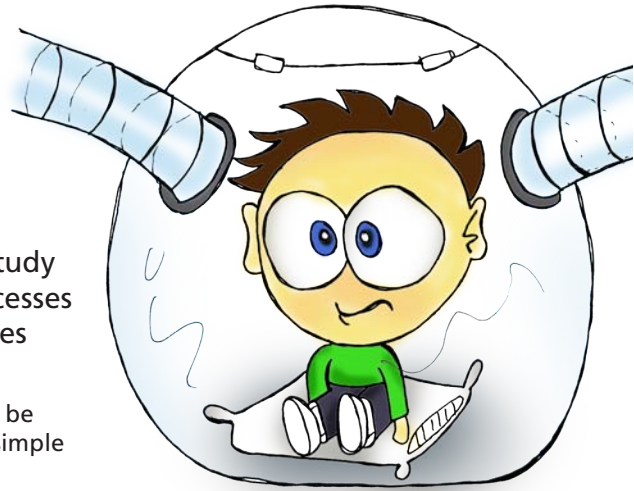
For some experiments, human subjects live in a respiration chamber for days at a time.

Scientists measure changes in heat with a calorimeter. This piece of equipment usually holds a body of liquid (such as water) that surrounds a heat source (in this case, a human). By measuring temperature changes in the liquid, scientists can calculate the energy involved in a chemical reaction in the human. However, this is complex science that relies on complete control of the environment, and it's definitely not cheap.