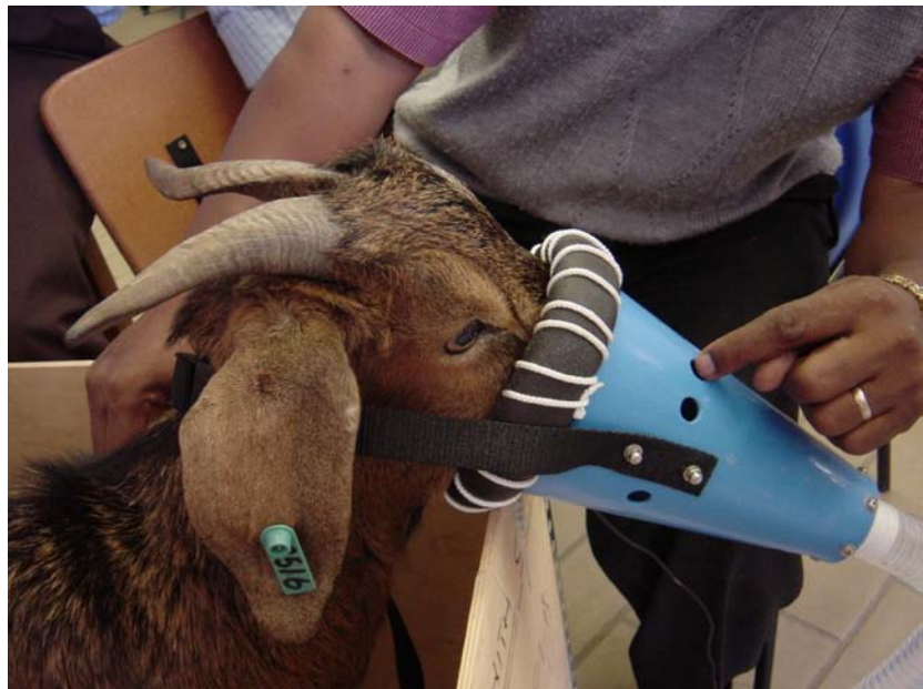
This goat wears a face mask attached to gas analysers. Working with domestic livestock is much easier than with wild animals.

Scientists routinely conduct metabolic research with animals in a laboratory. Working with non-human animals poses many challenges. Not all animals are willing, or able, to cooperate. Laboratory methods generally only provide information about energy expenditure when an animal is at rest, and conditions may be unnatural as animals are confined, restrained or wearing unusual apparatus. All of these factors may bias collected data or result in inaccurate data.