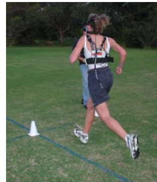
These subjects are attached to analysers and flow meters that collect information about oxygen consumption and carbon dioxide production.