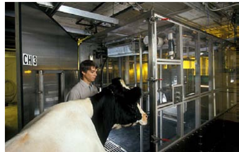
Animals in different types of respiration chambers.