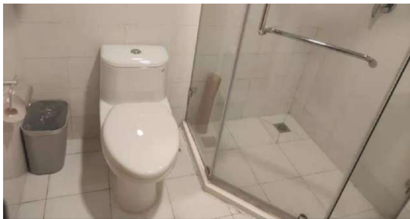
西澳大学学习中心学生宿舍 - 圆正宾馆 UWA Study Centre Student Dormitory - ZJU YuanZheng Hotel