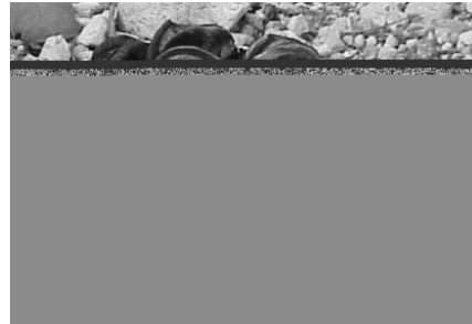
Banksia serrata with partially opened capsules Kurt Stueber (GFDL/GNU)

19. Oak-leaved banksia ( Banksia quercifolia ) does not resprout after fire. It only grows from seeds. These are contained in tough capsules, only opened by fire. After a fire passes through an area, capsules open and release seeds onto ground that has just been fertilised by ash, increasing their chances of survival.