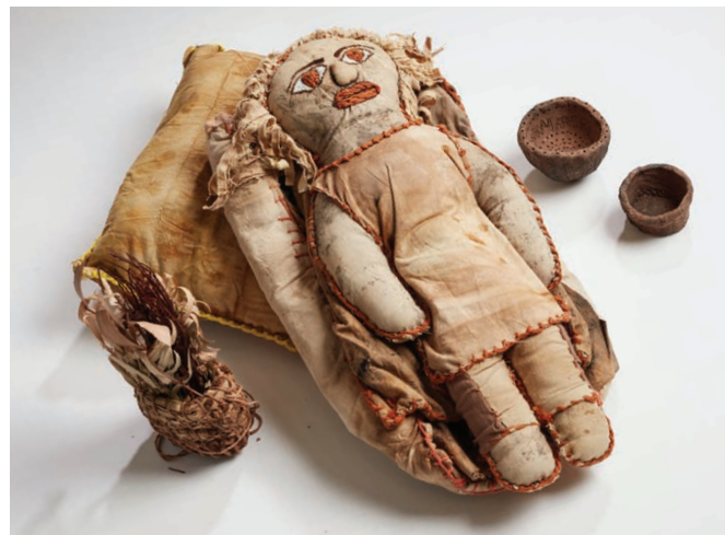
Marcelle Riley, Bibool Yok (Paperbark girl) , 2017, calico with natural dyes, embroidery thread, lavender pillow, artist's dilly bag and 2 clay pinch pots, 47 x 24cm

The prevalence of works that refer to fabric and textile traditions in this exhibition is in recognition of the capacity of stitched material to retain bodily traces of both the maker and those who have worn or touched the fabric. Marcelle Riley and Amanda Bell transform the present by stitching together experiences of the past. They, with Raquel Ormella and Narelle Jubelin, utilise textile traditions to expand outwards from the experience of individuals to speak of the personal and universal.