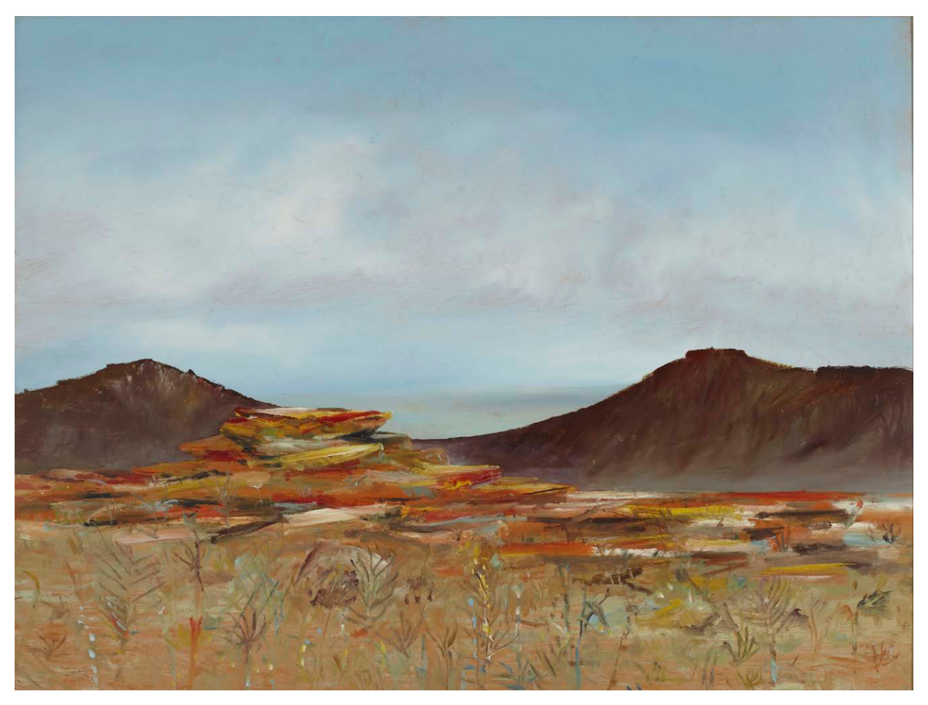
\textbf{Sidney Nolan}, Landscape Carnarvon Range, Queensland, 1948, Ripolin on board, 91 \times 121 \, \text{cm}, The University of Western Australia Art Collection, Tom Collins Memorial Fund, 1953}