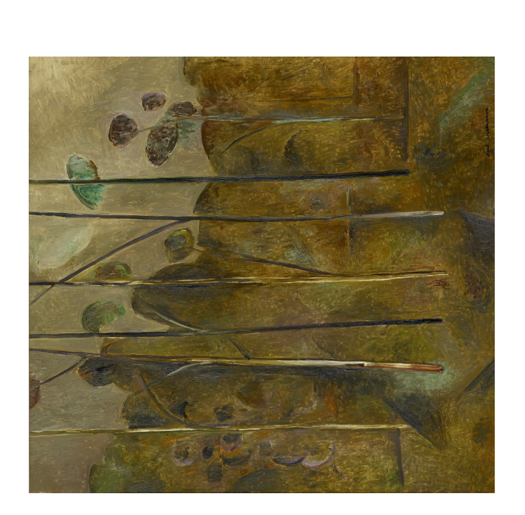
Fred Williams, untitled (trees in a londscape, Mittagong), 1957, oil on board, 94 x 88.5 cm, The University of Western Australia Art Collection, Tom Collins Bequest Fund, 1961