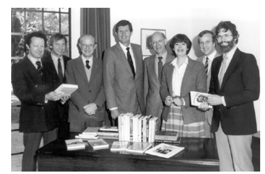
Donation of books to Library by the Canadian Government 1985

of books and periodicals meant that the financial problems of the 1970s continued in the 1980s. In 1983 the Library Committee expressed their "grave concern" over funding,2 and predicted immediate and "serious long consequences" in the quality of the University of Western Australia Library.<sup>3</sup> In that year the Library experienced its first systematic cuts to the serials collections. After consulting the Faculties, 451 journals were cut.<sup>4</sup> In 1987 a further $100,000 worth of cuts to serials were made,<sup>5</sup> and by 1991 just maintaining the periodicals was eroding the budget for monographs and further cuts to serials were forecast.6