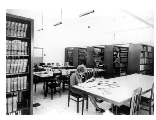
Law Library 1960s

The Law Faculty was established in 1927, the fourth faculty of the University of Western Australia. The Law Library was set up in the same year, but the collection did not expand significantly until recently. The history of the Law Library is one of faltering development and uncertain links to the administration of the central library.