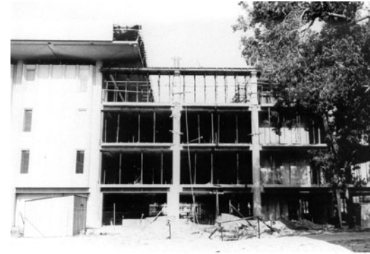
Extension to the Reid Library 1971

Under Jolley's tenure the principle of centralised purchasing was "re-affirmed." By the end of the 1970s, the Library was "throwing responsibility [for purchasing] back to Departments" but nonetheless the library retained more control of the acquisitions than it had previously had. There were no departmental collections, branch libraries