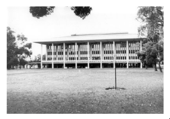
Reid Library 1960s

The University Library came to rely more and more on new forms of technology. Microfilm became increasingly important in the 1970s, especially for preserving documents such as newspapers and for providing access to documentary material held overseas. On demand