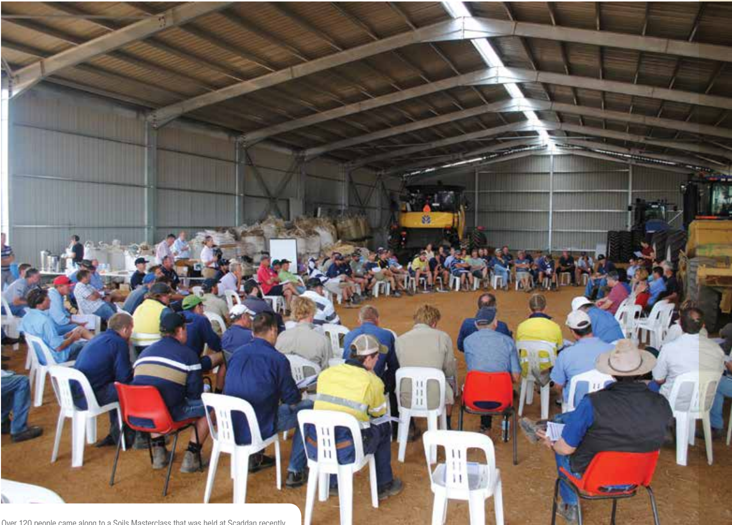
Over 120 people came along to a Soils Masterclass that was held at Scaddan recently.