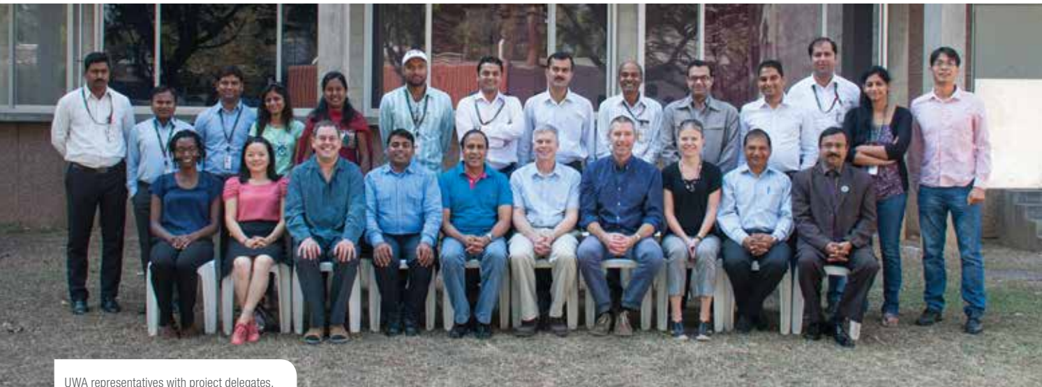
UWA representatives with project delegates.