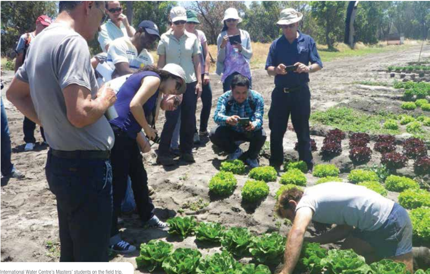
International Water Centre's Masters' students on the field trip.