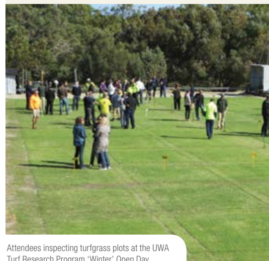
Attendees inspecting turfgrass plots at the UWA Turf Research Program 'Winter' Open Day

The morning provided UWA staff with an opportunity to discuss the implications of lowering water allocations with turfgrass managers in an informal setting, plus receive feedback from the industry which is funding the research in partnership with Horticulture Australia Limited (HAL).