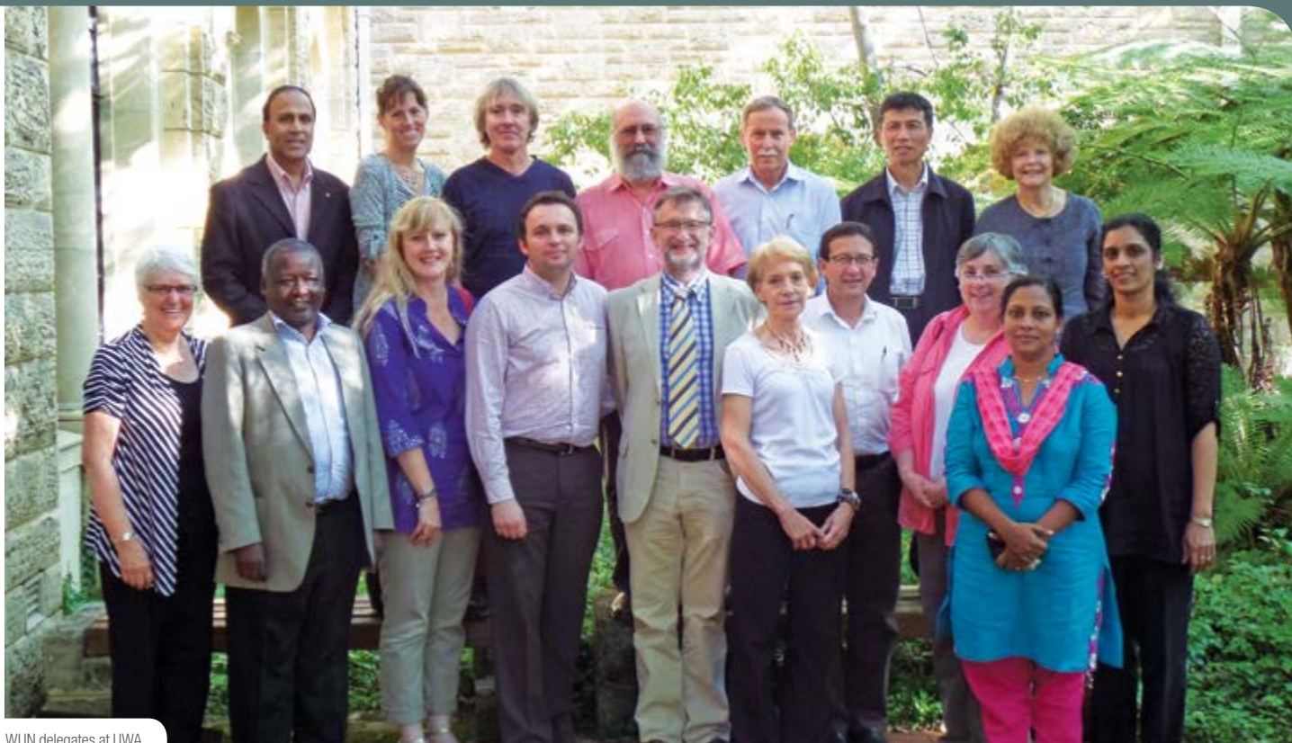
WUN delegates at UWA