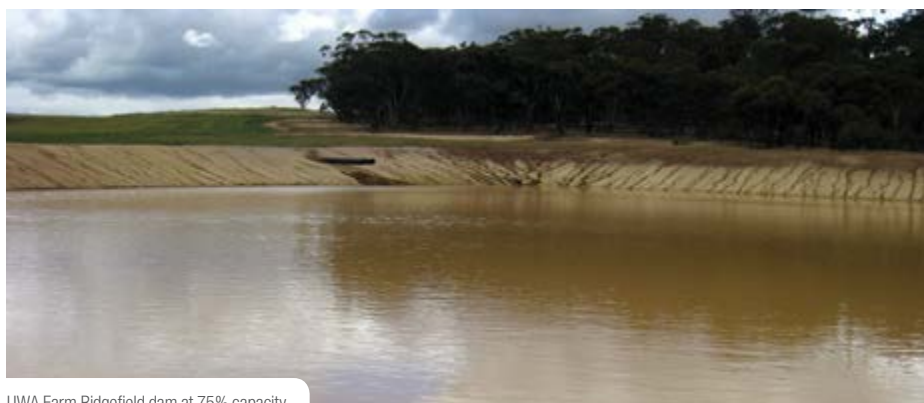
UWA Farm Ridgefield dam at 75% capacity

In 2011 a deep dam was excavated after extensive drill testing across the farm to find a site where sufficient depth could be excavated close to potential catchment sites. The dam has a capacity in excess of 20,000 cubic metres and is the primary source of fresh water on the farm. Combined with two older dams that are scheduled to be renovated, the farm will have a reliable water supply into the future.