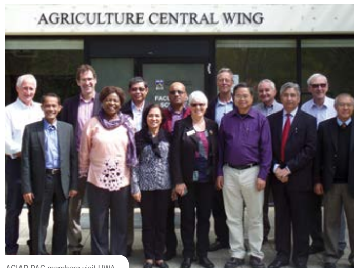
ACIAR PAC members visit UWA

He added that the PAC members were interested in the discussions on the importance of research to universities and the common issue of attracting new students to agriculture related studies.