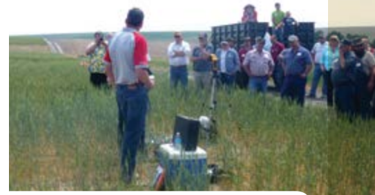
Engaging farmers and agronomists at Lind Farm Field Day