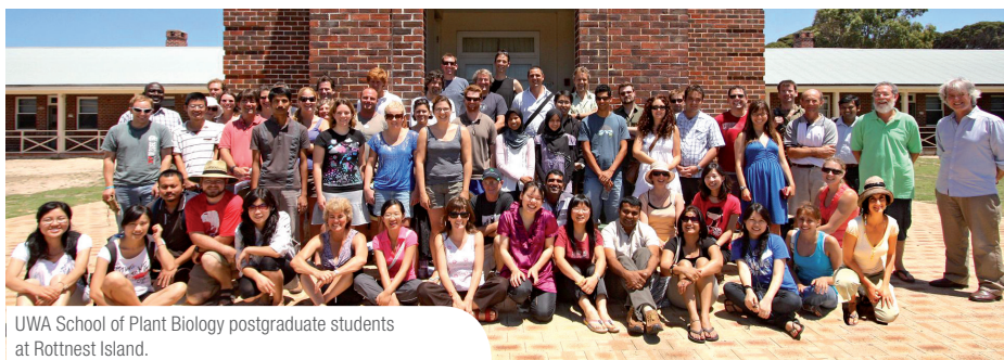
UWA School of Plant Biology postgraduate students at Rottneest Island.

At UWA we intend to remain at the forefront of developing tomorrow's agriculture.