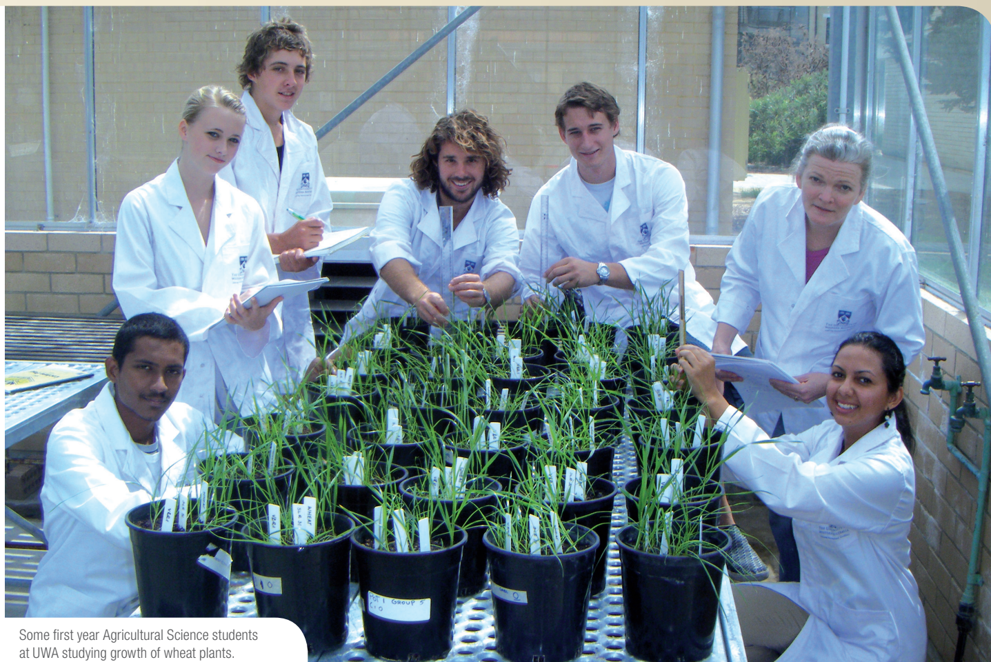
Some first year Agricultural Science students at UWA studying growth of wheat plants.