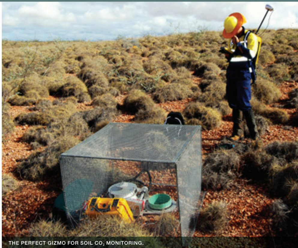
THE PERFECT GIZMO FOR SOIL CO 2 MONITORING.

( ˌvɪʒən ) the ability or an instance of great perception, especially of future developments