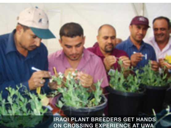
IRAQI PLANT BREEDERS GET HANDS ON CROSSING EXPERIENCE AT UWA.