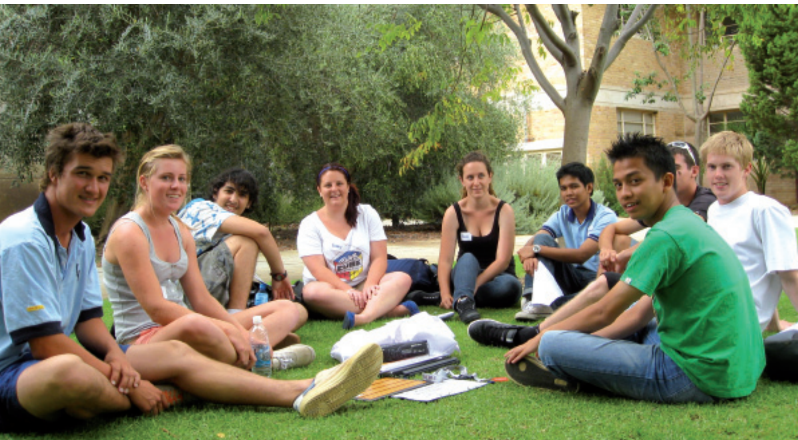
UWA AGRICULTURAL SCIENCE UNDERGRADUATES

All of the Australian universities are positioned behind the University of Wisconsin Madison and the University of Bristol in this field. This is an excellent performance that testifies to the standing of agricultural sciences in WA.