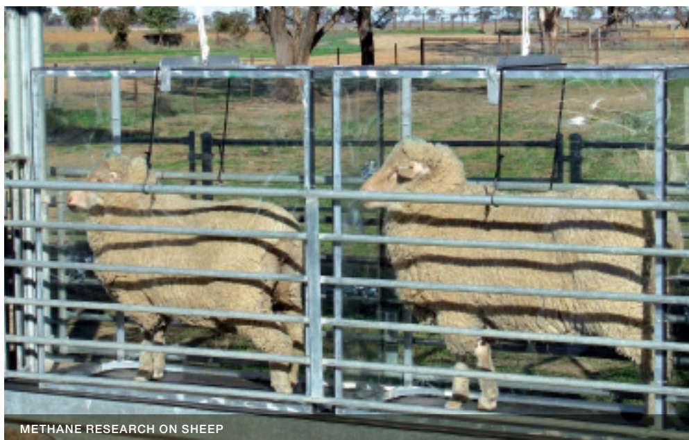
METHANE RESEARCH ON SHEEP

The natural approach is also very cost effective for farmers, as it relies on behavioural intervention to control reproduction, rather than expensive methods based on hormones. It will help give Australian farmers a competitive advantage over their European counterparts.