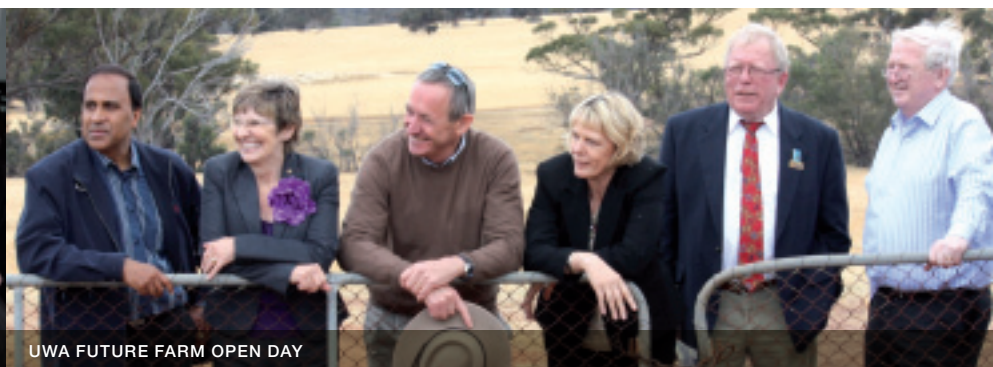
UWA FUTURE FARM OPEN DAY