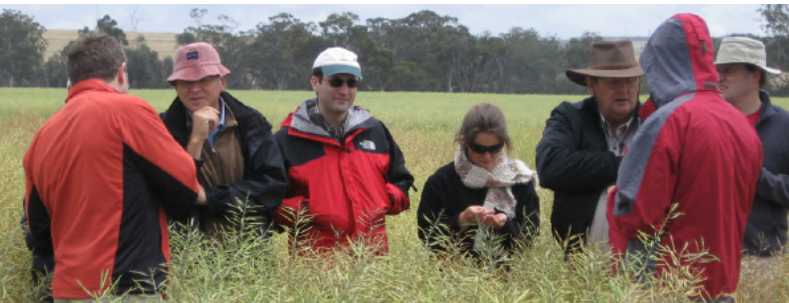
CANOLA BREEDERS INSPECTING BREEDING TRIALS