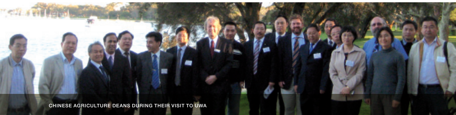
CHINESE AGRICULTURE DEANS DURING THEIR VISIT TO UWA

The UWA Institute of Agriculture has maintained its excellent relationship with several international Universities. New ties were strengthened by signing several Memorandums of Understanding (MoU's).