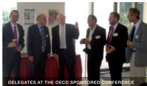
DELEGATES AT THE OECD SPONSORED CONFERENCE