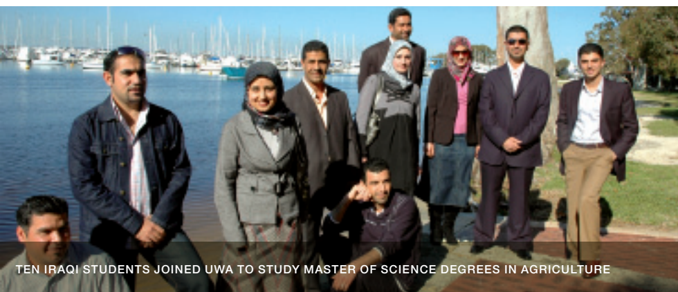
TEN IRAQI STUDENTS JOINED UWA TO STUDY MASTER OF SCIENCE DEGREES IN AGRICULTURE

The trainees were from a variety of scientific backgrounds, many from managerial roles within the Iraqi Ministry of Agriculture. Some work in more remote provinces of Iraq including Babylon, Al Mushraq and Dhi-Qar. Their research interests include work with salinity, tomatoes, date palms and irrigation.